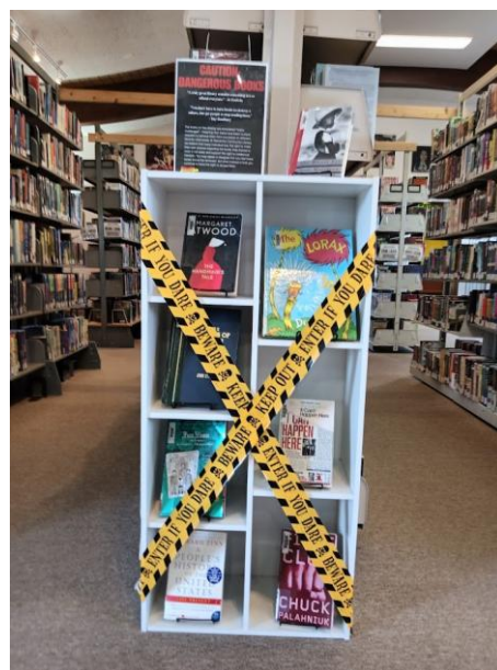
Banned Books Week Display: October 5-11