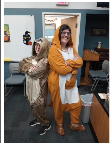
The Library won the citywide costume contest for Best Department Costume.