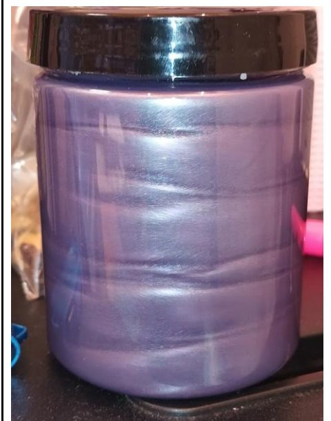
Glitter Jars made for September's Mindful Making project