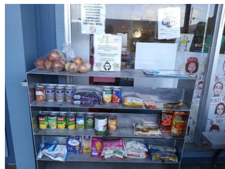
With SNAP benefits being uncertain, community members kept the little free food pantry stocked with proteins, fruits and vegetables both fresh and canned, dry beans, rice, and items like baby formula and toiletries.